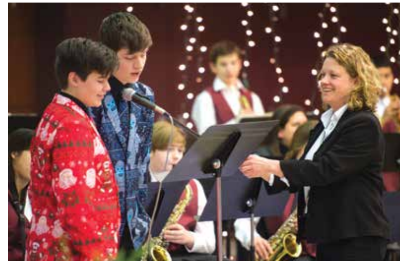
Juneau-Douglas High School