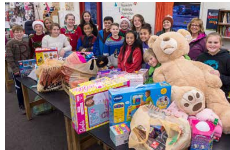
Floyd Dryden Middle School